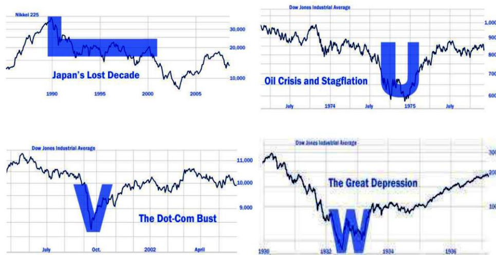
Fig. 2 Shapes of Recoveries http://investors.lk/12794/Shape+of+the+Recovery

The evolving terminology of cycles reflects their varying character, whether in nature or in length, and the necessary caution required from those that try to identify and date them. It also translates economists' and analysts' hesitations, doubts, and diverging points of view. As no two cycles are alike, the need has been felt to qualify the types of recessions they give rise to, hence the alphabet soup of L-shaped, U-shaped, V-shaped, W-shaped (or double-dip) recoveries to translate their varying degrees.