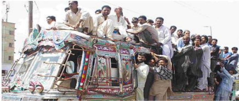
OWING to an unexpected closure of CNG supply and consequent public transport woes in the city on Friday, commuters were compelled to risk their lives by crowding the rooftops and clinging to the sides of buses.