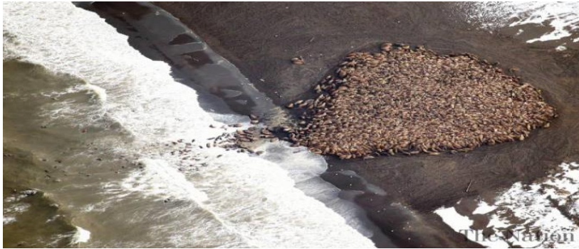
35000 walrus mass on Alaska Beach due to 'climate change'