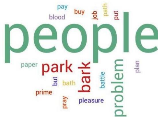
Fig. 4 Most frequently mispronounced words (infographics)

Although some linguists (e.g. Morley, 1991) claim that you cannot approach pronunciation instruction with a one-size-fits-all methodology, in this research we will look at some practical activities that should be effective and efficient for Arab learners of English. Such activities are pedagogically and methodologically sound and are aimed to improve the quality of the target segmentals. During our study, the Omani teachers of English submitted a concise word list of most frequently mispronounced English words.