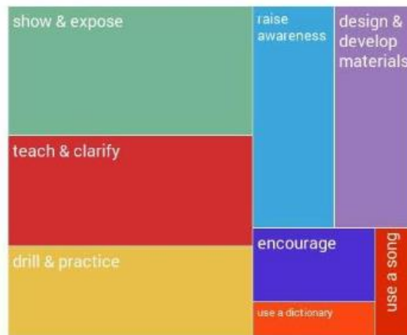
Fig. 3 The best ways to deal with pronunciation challenges (summary)

Finally, the researcher asked the informants about the steps that need to be taken to avoid these pronunciation challenges from a pedagogical and methodological perspective.