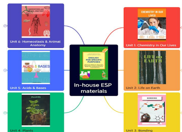
Fig. 1 Cover pages of units of ESP compiled materials

Taking into consideration all of the above-mentioned issues, instructors at SDU have compiled six units for an ESP course related to chemistry and biology. Each unit includes an introduction, fundamental principles of the subject matter, language skills, grammar, and a unit review section. The units are titled Chemistry in Our Lives, Life on Earth, Bonding, Plants, Acids & Bases, and Homeostasis & Animal Anatomy (see Figure 1).