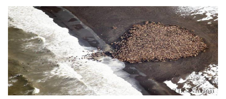
35000 walruses mass on Alaska Beach due to 'climate change'

• Ask them to make a poster presentation on a topic supporting the details with the help of cutouts from the newspaper (in the form of news, columns, reports, etc.). For example, they may make a hand-made poster for making presentation on 'the advancements of technology', 'child abuse', 'tips for personality building', 'earthquakes', 'load-shedding', 'diseases', etc. This activity will help them support their point of view with examples, facts and statistics, and delve deep into different aspects of engineering fields through newspapers.