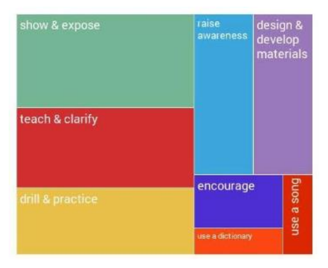
Fig. 3 The best ways to deal with pronunciation challenges (summary)

Finally, the researcher asked the informants about the steps that need to be taken to avoid these pronunciation challenges from a pedagogical and methodological perspective.