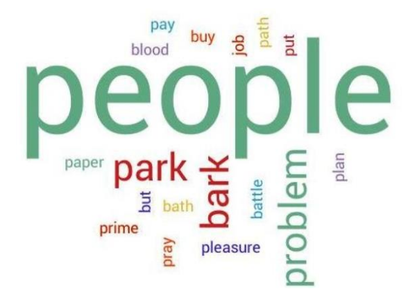
Fig. 4 Most frequently mispronounced words (infographics)

Although some linguists (e.g. Morley, 1991) claim that you cannot approach pronunciation instruction with a one-size-fits-all methodology, in this research we will look at some practical activities that should be effective and efficient for Arab learners of English. Such activities are pedagogically and methodologically sound and are aimed to improve the quality of the target segmentals. During our study, the Omani teachers of English submitted a concise word list of most frequently mispronounced English words.